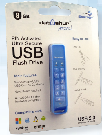
datAshur Personal in retail packaging